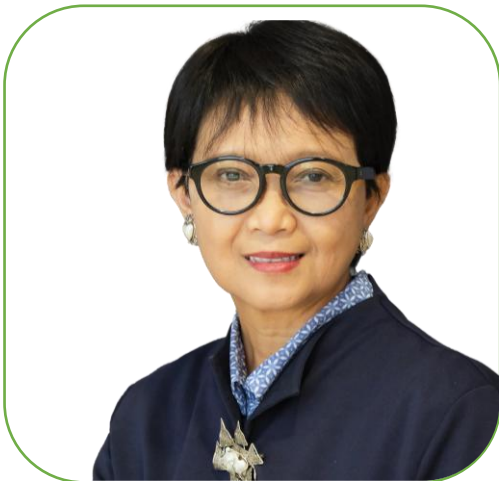
Retno Lestari Priansari Marsudi

Komisaris Independen BMHS | Menteri Luar Negeri RI 2014 - 2024